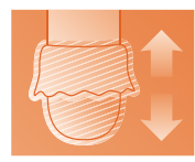
Easy Glide PLUS