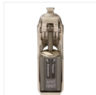
Pneumatic swing phase control