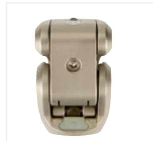
Weight activated brake