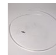
Replacement Cable NCP-LK