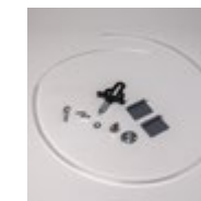
Knee External Lock Kit (inc. with knee) NCP-KELK