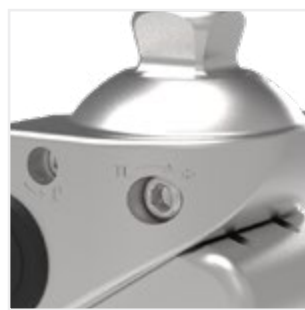
Updated remote lock location