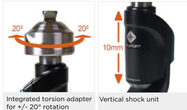
Integrated torsion adapter for +/- 20° rotation