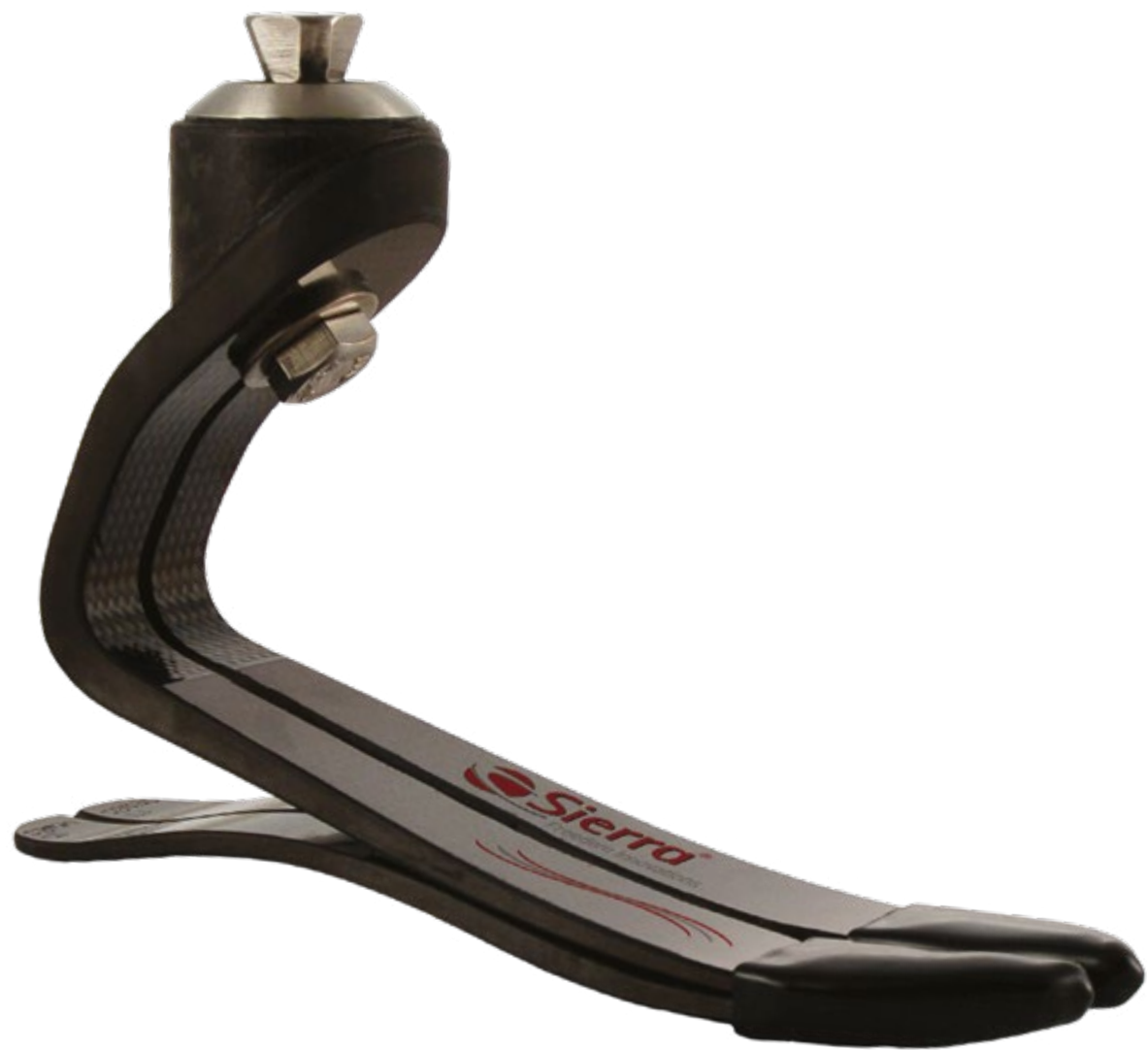
Sandal toe: sizes 22-28 only