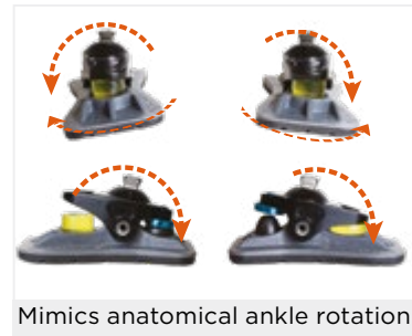
Mimics anatomical ankle rotation