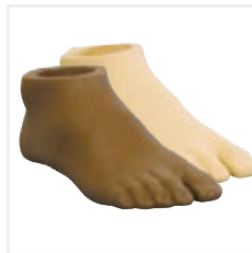
Light/dark Sandal Toe Footshell