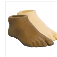
Light/dark Sandal Toe Footshell