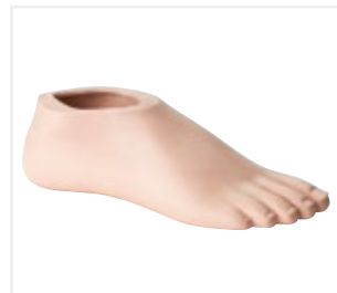
Solid toe foot shell