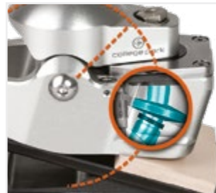
One pivot angle