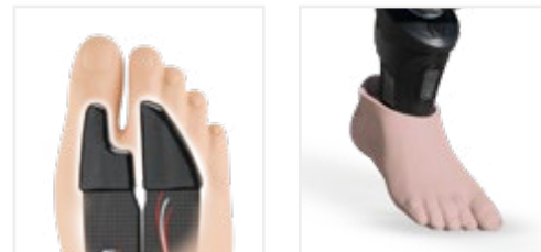
Sandal toe: sizes 24-28 only