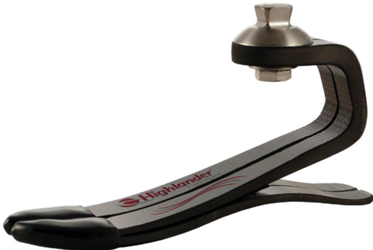
Sandal toe: sizes 22-28cm only