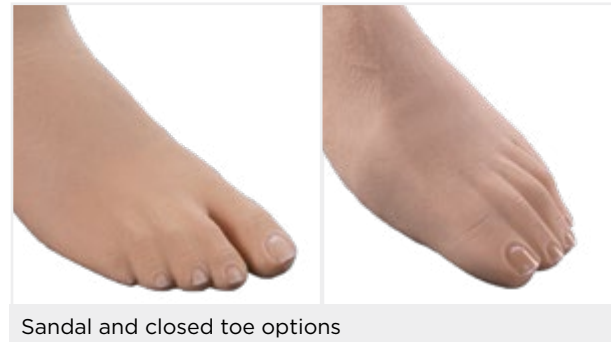
Sandal and closed toe options