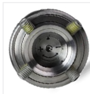
Easily adjust resistance