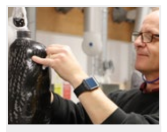
Build adjustability, anywhere.