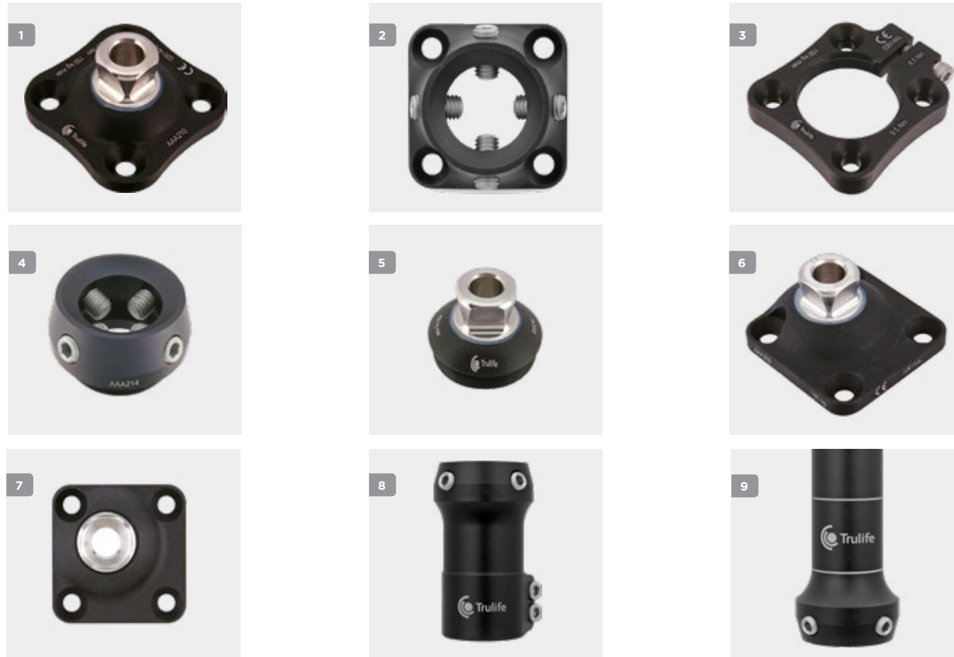
Aluminium 30mm Structural Components